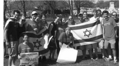
A good effort...but not good enough.

dents against the hateful utterances of Arabs and communists on campus. But one of my students was actually upset that 136 Palestinian children were killed by the Israeli Defense Forces last year. I had to remind her that those so-called 'kids' are really just terrorists waiting to happen."