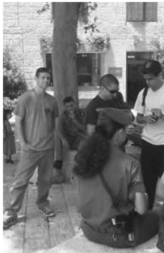
The author gets as close as he can to those cool Israeli soldiers, i.e. JEWS WITH GUNS!

People had always told me that I would finally understand what it means to be Jewish when I got to Israel. Before I went on Birthright I didn't really believe them, but in Israel things just made sense. I knew I was home from the moment I arrived. For example, they were strip-searching some other people at the airport, but our group whizzed right through — because we were Jews!